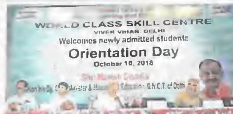
Delhi government officials at the orientation day ceremony at the World Class Skill Centre in Vivek Vihar on Wednesday.

Citing examples from other developed countries, he made special note of the Senai courses in Brazil, the dual VET (vocational education and training) system in