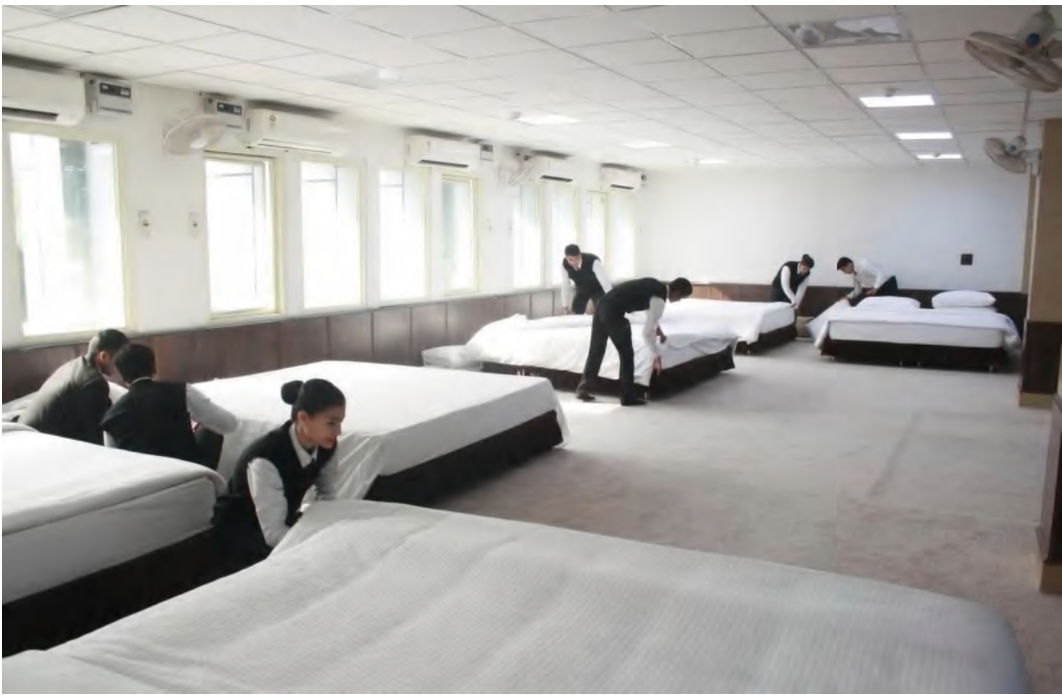
Trainees of Hospitality Operations are at work in the House Keeping Lab