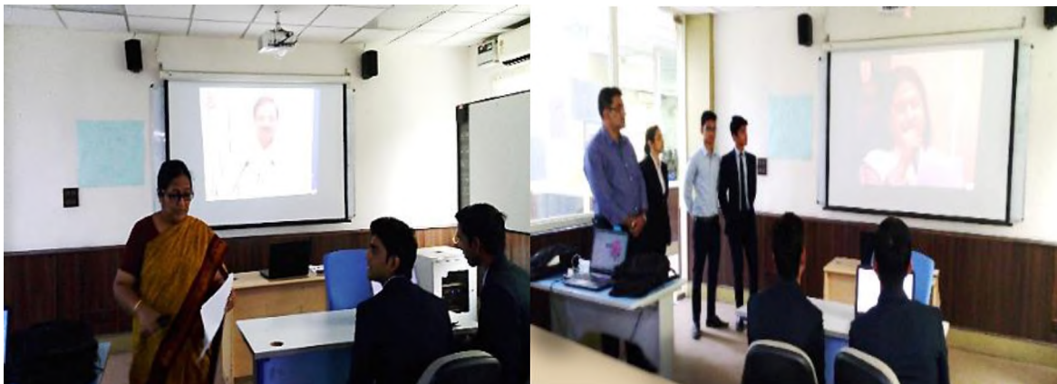
IT/ITeS CLASSROOM - LIVE TELECAST on the theme – “Young India, New India – A Resurgent Nation : from Sankalp to Sidhhi” on 11 th September 2017.