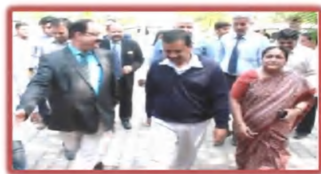
Visit of Hon'ble CM & Dy.CM of GNCT on 9 th March 2017

The methodology will be self-reliant learning with focus on peer learning. Course shall be conducted in English language. Assistance is provided to all trainees for placement in prominent MNC's, Hotels, Financial Institutions, IT & ITES companies and startups for gainful employment.