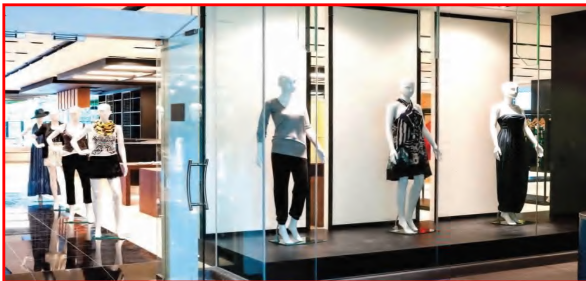
Retail Training Lab