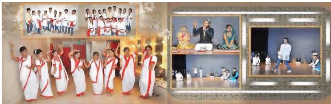
World Tourism Day celebrated on 27-Sep-18 by the students of Hospitality Operations