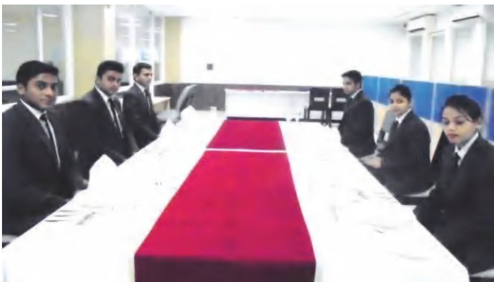
Training on Dining Etiquettes