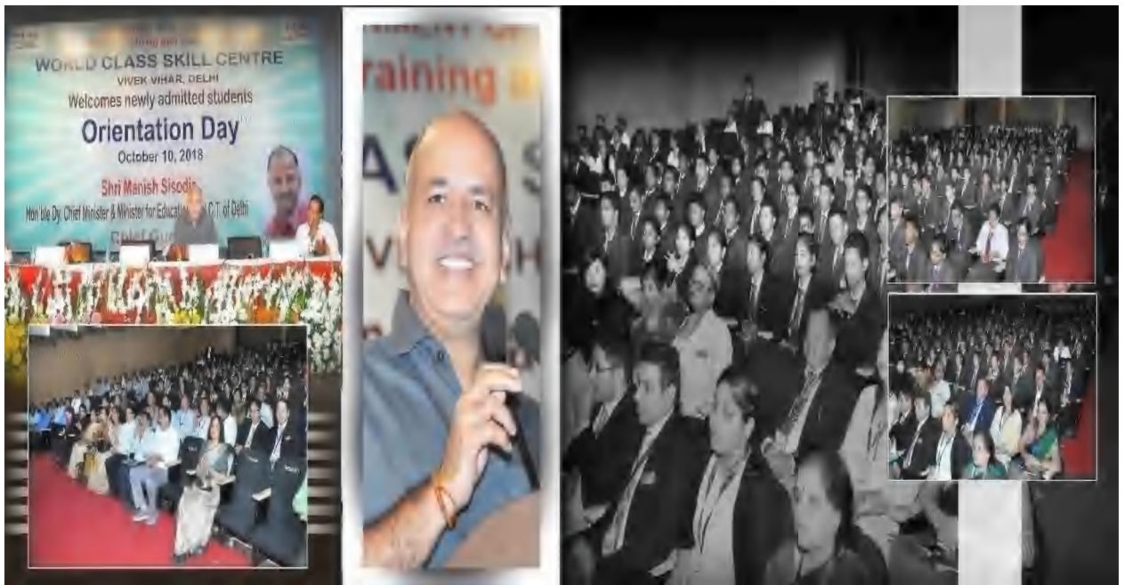
Sh. Manish Sisodia, Deputy Chief Minister & Minister of Education, Delhi on the occasion of Orientation Day for the students of the session Aug18 – Sep19 held at Kamani Auditorium on 10 Oct 2018