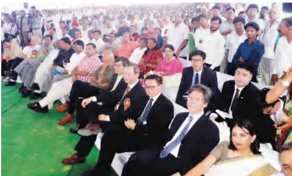
Singapore Delegation at Opening Ceremony of WCSC, Delhi