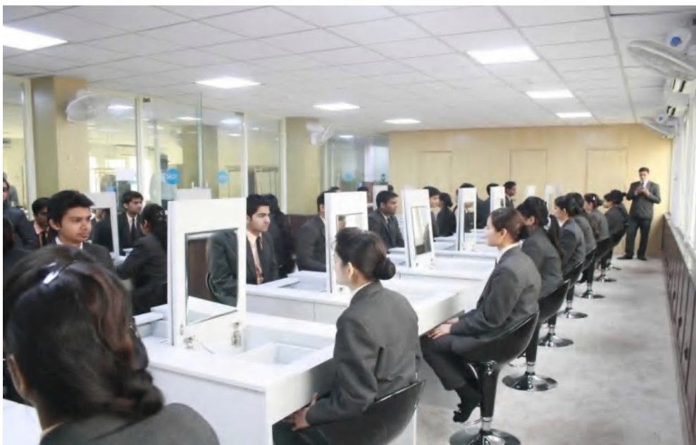
Professional Image & Etiquettes Lab