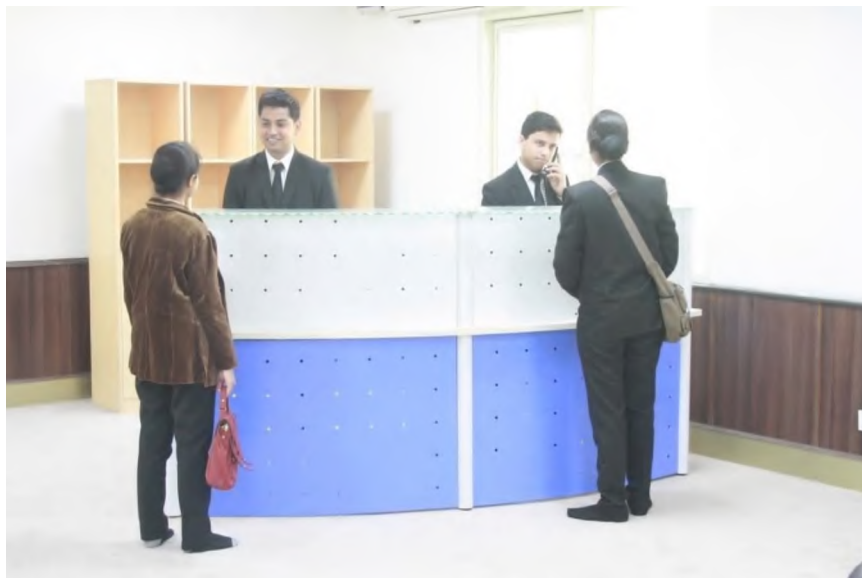
Front Office (Role Play) Training to the trainees of Hospitality Operations.

(N) Caste certificate in the name of the applicant from competent authority will have to be submitted at the time of admission failing which the candidate will be considered under General category. For availing reservation under OBC category in Delhi State, Delhi OBC list will be considered. The OBC-Non Creamy Layer certificate must be accompanied with the original OBC certificate if issued prior to 1st April, 2019. Candidates passing qualifying examination from institution located in Delhi and having OBC certificate from outside Delhi shall be considered as Delhi General Candidate. Similarly, candidates passing qualifying examination from institutions located Outside Delhi and having Delhi OBC certificate shall be considered as Outside General Candidate. Category mentioned in application form is not changeable at the time of counseling.